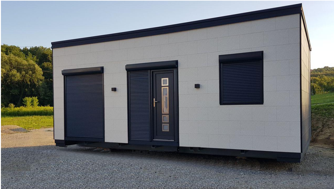
Front view 1