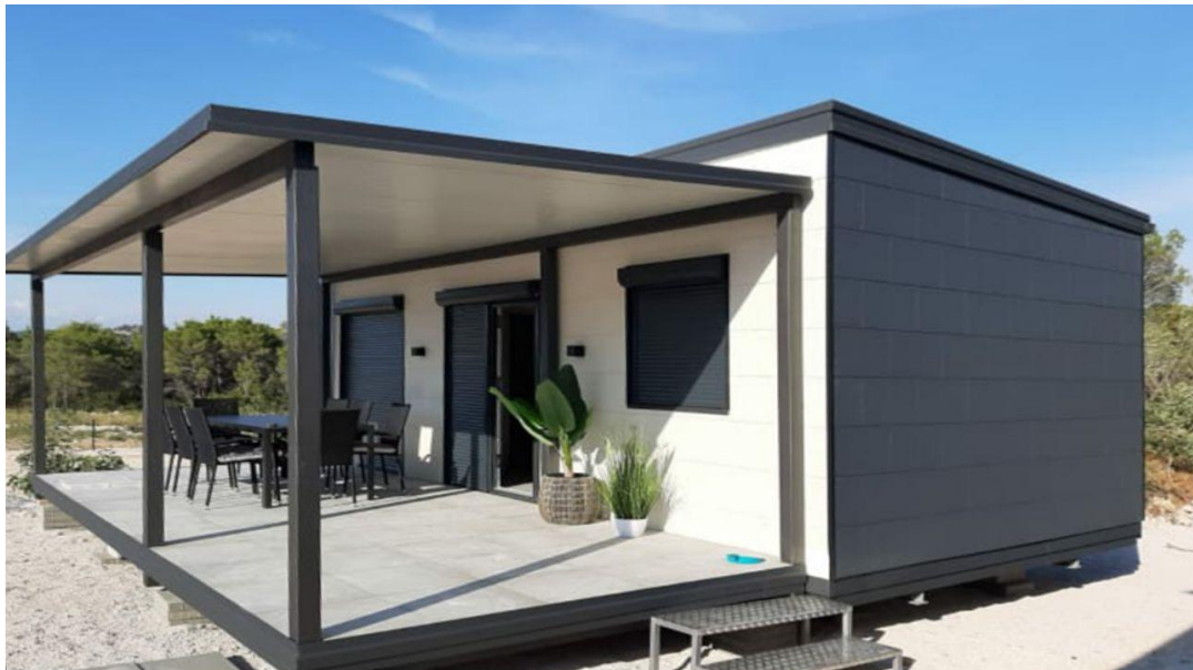
Front view 2