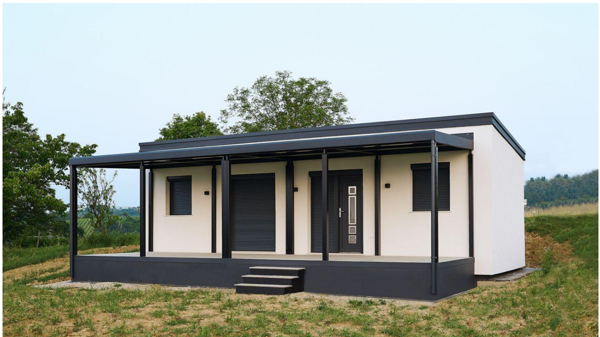
Front view 2