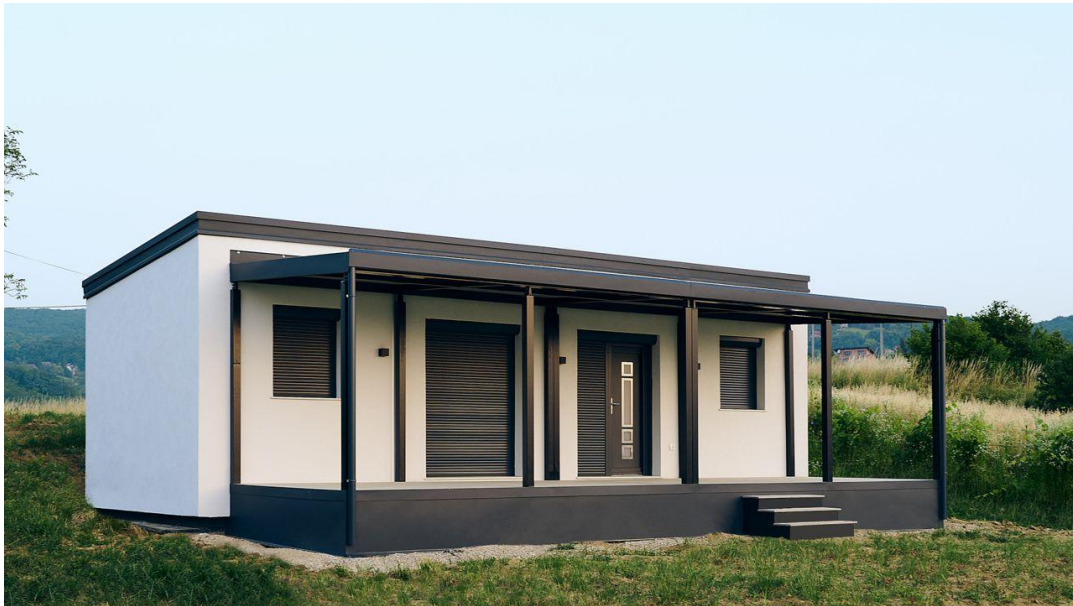
Front view 3