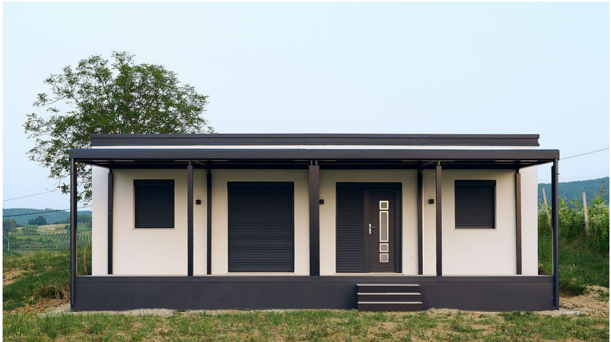
Front view 1