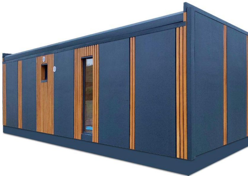
Backside view 2