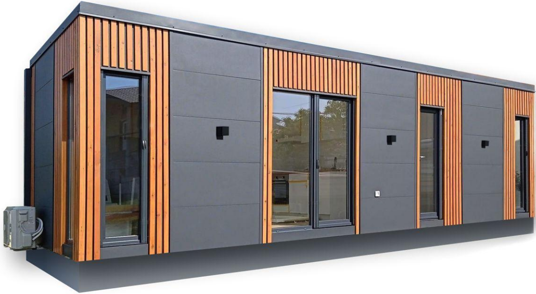
Front view 1