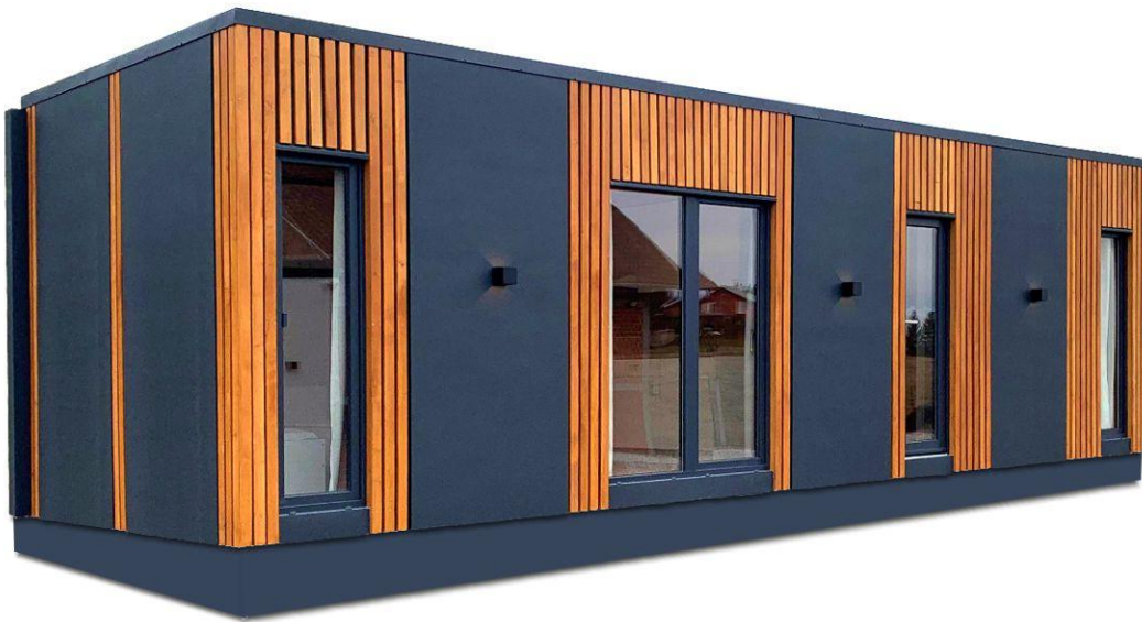
Front view 2