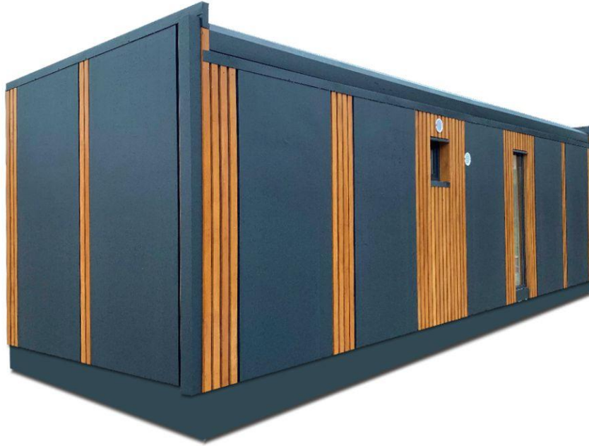
Backside view 1